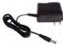
S75-SCB Standard AC Adapter (Included)