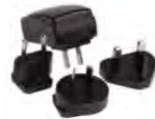
S75-SCB Universal AC Adapters